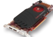
ATI FirePro™ V7750