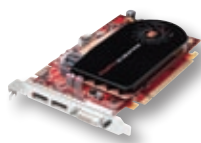
ATI FirePro™ V5700